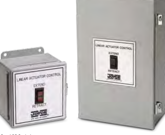
AC and DC Controls